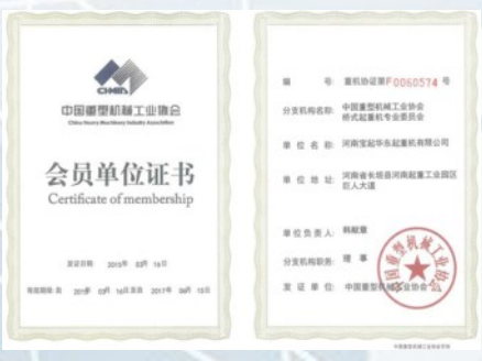
China heavy machinery industry association-Membership certificate