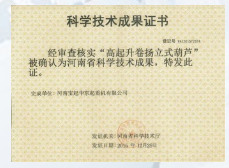
Certificate of scientific and technological achievements