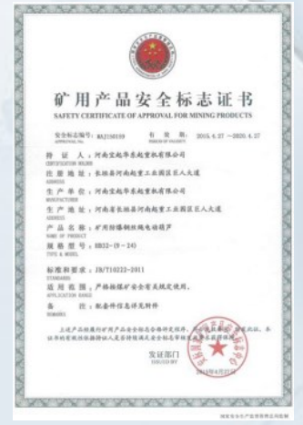
Safety mark certificate for mineral products