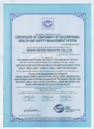
IOS certificate occupational and health