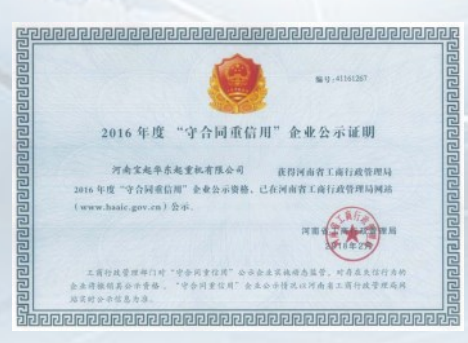
Abide by the contract honor enterprise