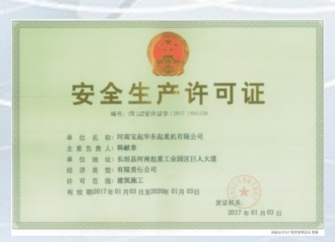
Safety production license