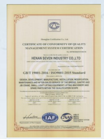
ISO certificate quality