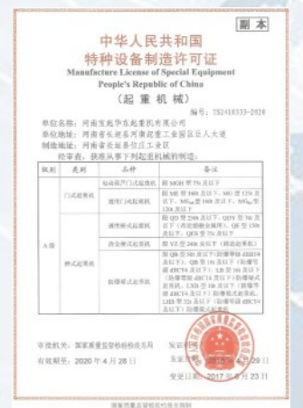
Special equipment manufacturing certificate