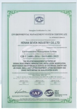
ISO certificate environment